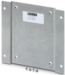
Mounting plate for SFNT switches

Please be informed that the data shown in this PDF Document is generated from our Online Catalog. Please find the complete data in the user's documentation. Our General Terms of Use for Downloads are valid ( http://phoenixcontact.com/download )